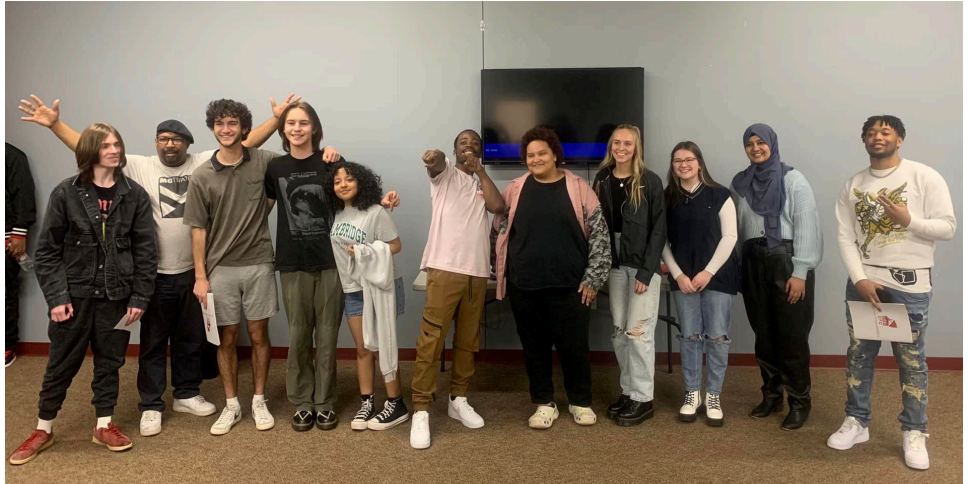
Our 2023 Arkansas Youth Civic Engagement Day was a success with over 70 people in attendance! The day consisted of presentations, discussions and performances from four youth-led organizations.

It compels traditional school districts to partner with open-enrollment charter schools to operate low-performing traditional schools. It did establish a $50,000 minimum