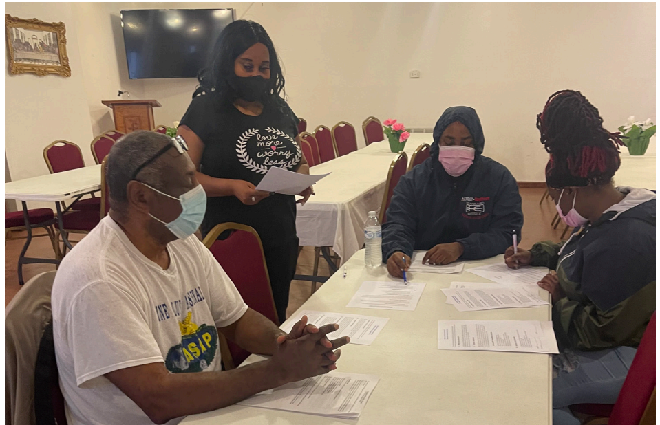
Community Organizers with the Panel continue to do COVID-19 Education across the state.

The Governor and her school-privatization allies praised the Arkansas State Board of Education's May 5 decision to approve the first-of-its-kind-in-Arkansas "school transformation" contract for three years, handing these vital neighborhood public schools over