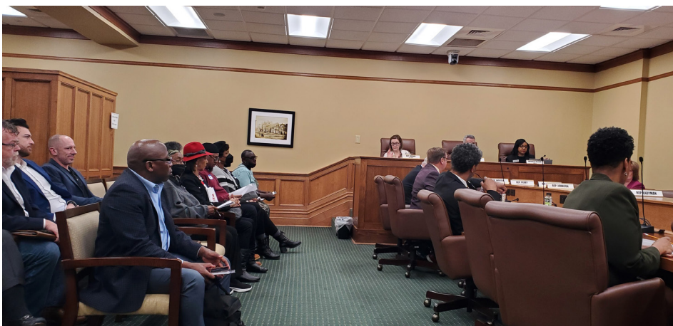
Numerous members and allies attended legislative committee meetings during the 2023 Lobby Day on Feb. 15, some testifying and speaking directly to their representatives.

The bill deems some people unredeemable by virtue of their conviction and denies them the opportunity for rehabilitation. It drastically dismantles the parole system. This Act will vastly expand the rate of